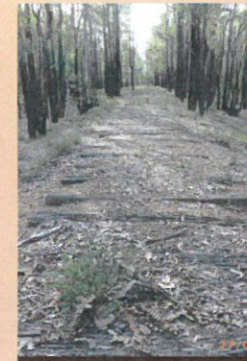
Typical Temporary Formation

The large timber slabs that form the boundary of this playground were formerly part of a road bridge crossing the Yarragil Brook on Murray Road, south-east of Dwellingup. Murray road was an important access link to Yarragil formation, which was part of a former railway line. Temporary railway lines were laid throughout the forest to facilitate the transportation of logs to timber mills. This rail system replaced horse and then steam driven whims. A formation was manually constructed and then sleepers and rails were laid upon it. When the area was logged out, the rails and sleepers were relocated.