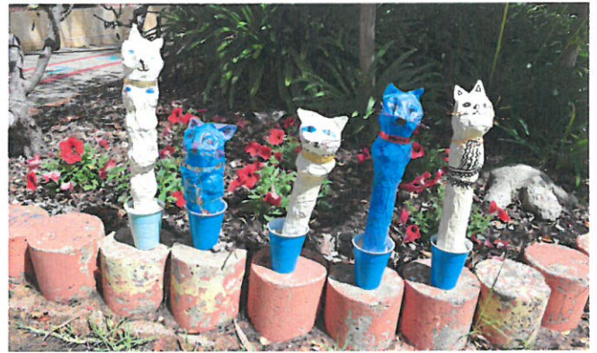
Above: Cats up close.