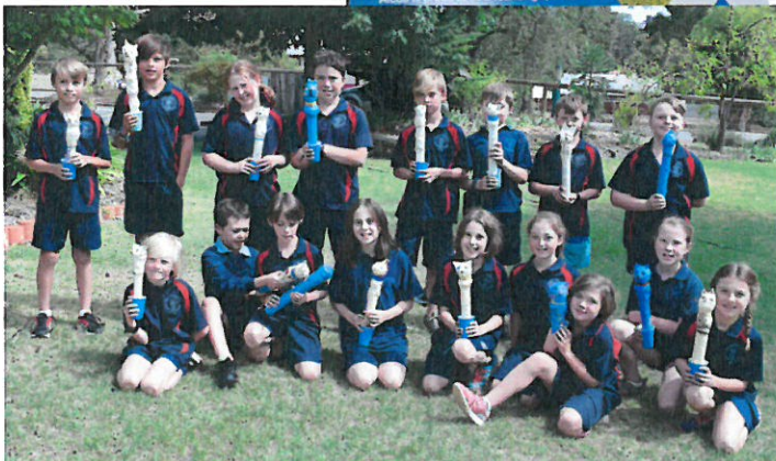
Above: The year 4/5/6 class with their cat sculptures.