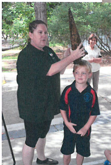
Left: Is this a ‘Lucusosaur or a Triceratops?