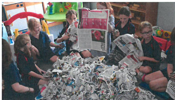
Above: Students made a 'mountain' of newspaper balls to stuff shirts and trousers.