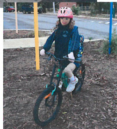
Right: Even our Pumpkin Crow is wearing a helmet.