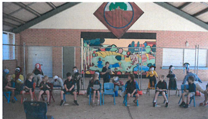
Above: Meet the scarecrows and their creators.

The year one students have not made their scarecrows yet but they have been growing some beans. The students wrote some stories about them. The year 2/3 students were thinking of names for their scarecrows so the year 1s thought of some very interesting names for their beans.