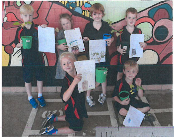
Above: Meet the beans.