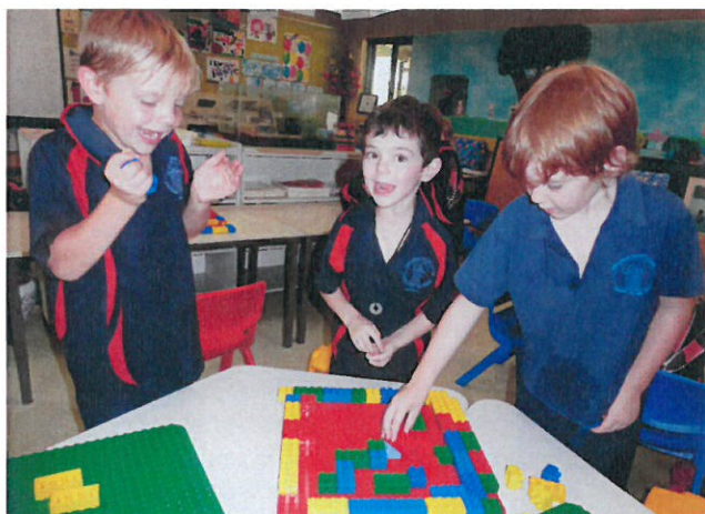
Above: No caption required!

Students in years PP / 1 used a variety of materials to construct mazes.