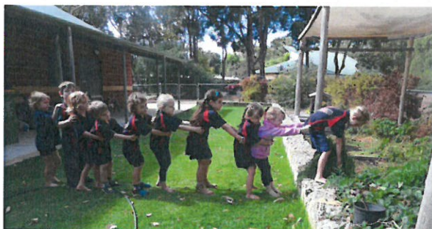
Above: The students pulled and they pulled and they pulled and they PULLED until finally...

The K / PPs noticed that one of their carrot plants looked really, really huge. They decided to pull it out!