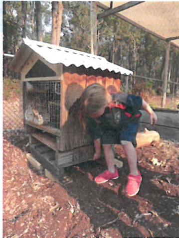
Right: Tabatha finding out that the insect hotel is heavy.