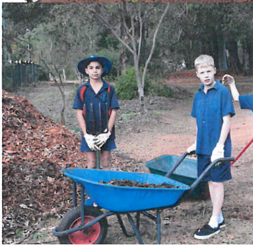
Above & left: Busy in the garden.

Meanwhile, in class we are learning more about fire and how it affects our jarrah forest.