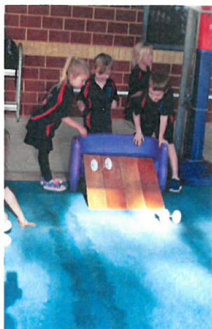
Left: The junior students investigate wheels and axles. The students made the wheels and axles and then compared and investigated where they tracked.