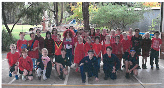
Above: What a bright group!

Thank you for your support parents $50.00 was raised for the Volunteer Fire Brigade . We thank the “firies” for keeping us safe.