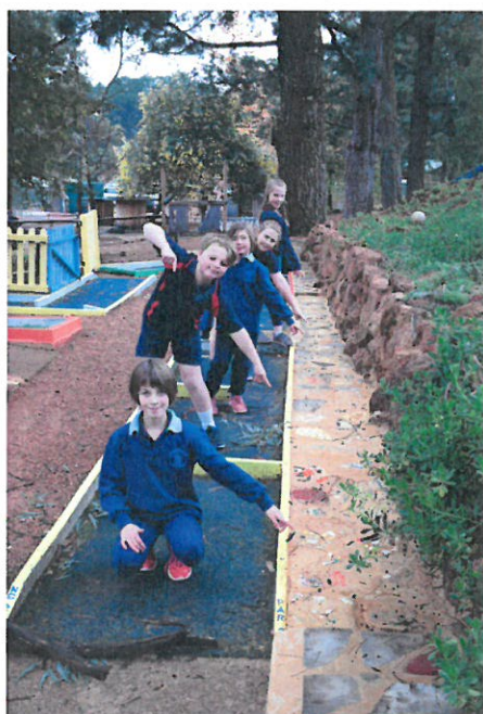
Left: Check out our stunning mosaics!