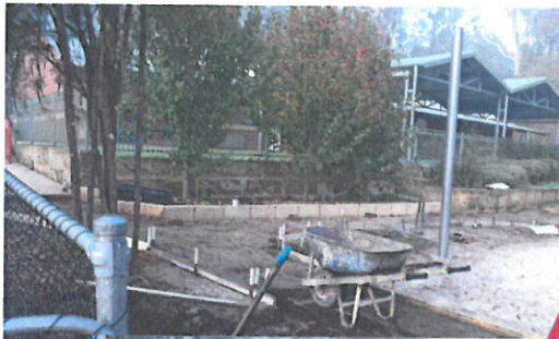
Left & below: Before!