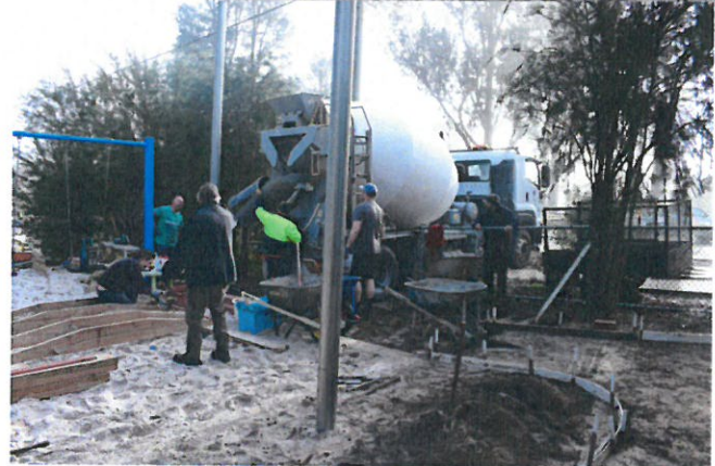
Above: The cement mixer arrives and the wheelbarrow crew spring into action.