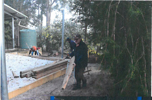
Above and right: Bridge building in progress.

Thank you to all concerned. Your generosity and hard work have greatly enhanced the play area for our youngest students.