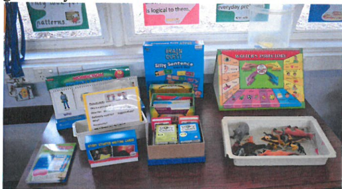
Above: The year 1/2/3 students have these exciting new Writing prompts as well as other resources.

At the end of last term, each class was presented with $1000 to spend on teaching materials. Teachers have had a fantastic time purchasing resources that will enhance their teaching programmes. We thank the P&C for their generosity.