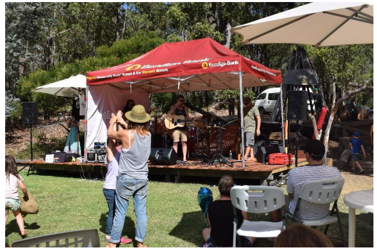
MoreDidge Brothers Performing on the 'Bendigo Bank' Stage