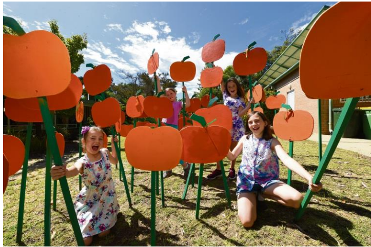
Students Photo Shoot.

Kelly has advised that on the weekend of the Festival our Facebook Page reach stood at 32,000 people!