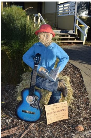
Entry by Trails Bookshop