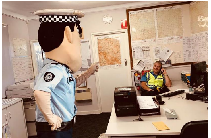
Constable Care, Dwellingup Police Station.

Activities this year included those outlined on the following pages plus so much more, including creative Face Painting, our Bouncy Castle and some very memorable roving entertainers including our Stilt Walkers, Constable Care, (thanks to our industrious local Constabulary) and our very own roving Pumpkin Mascot, (aka Colleen Campbell-Warr).