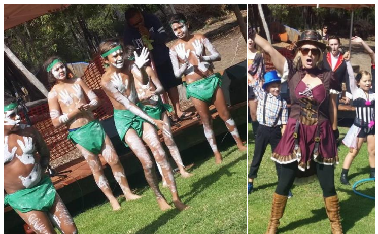
Wardong Dance Group and Musical Kite String