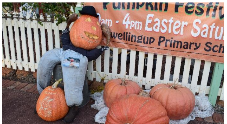
Entry by Geoff Warren

We hope to see you all again next year for Dwellingup Giant Pumpkin Festival 2019!