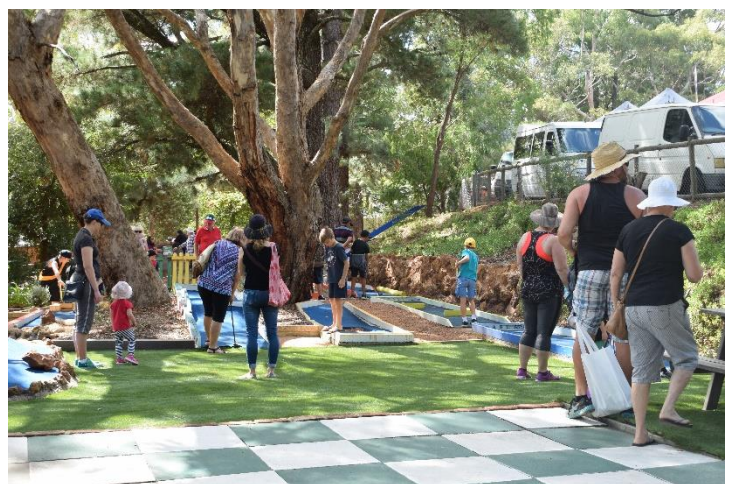
Mini Golf and Garden Chess Area

One particular area that looked exceptionally 'on par' was the Mini Golf and Outdoor Chess area. It was wonderful to see visitors taking part in some Mini Golf and enjoying the picturesque area throughout the day. Were there many golfers on the day? ... Well, that was a fore-gone conclusion!