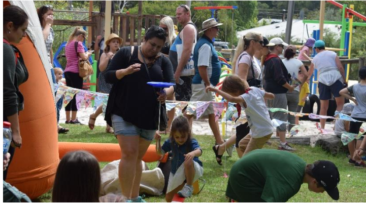
Circus Tricks Underway at the Festival

The Circus Challenge once again delighted the crowds with their fabulous, interactive, performances. Our visitors certainly relished taking a hands on role and, as always, much laughter and cheering was heard from the area.