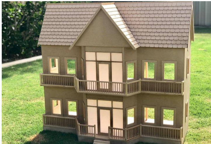
Doll's House donated by the Men's Shed.

There were some awesome raffle prizes on offer including a gourmet adults only hamper featuring beautiful wines from Vasse Felix, Olive Farm Wines and Ferguson Falls Wines Café, along with Silent Auction items such as the handcrafted Doll's House pictured below donated by the Mandurah Men's Shed.