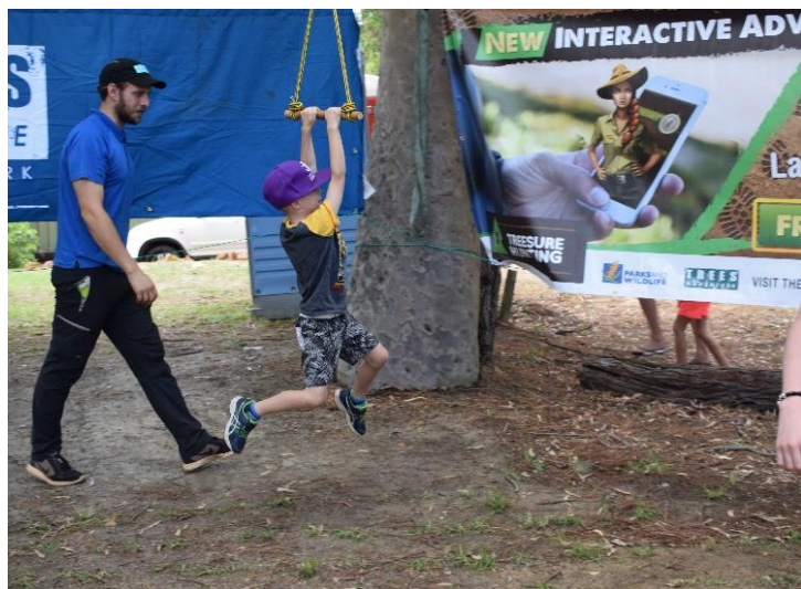
Trees Adventures Display

24 Carat Restaurant, Caraholly Orchard, Crossroads Gallery, Di's Little Cabin, Dwell Cottage, Dwellingup Adventures, Dwellingup Forest Lodge, Dwellingup IGA, Dwellingup Pub, Dwellingup Sawmill, Dwellingup Silver, Forest Discovery Centre, Hotham Valley Railway, The Blue Wren Café, The Trails Bookshop, The Wine Tree Cidery, Touch of Aroma, Trees Adventures, Vergone's Fruit Stall Dwellingup, Wendy Binks and With Love By Bec.