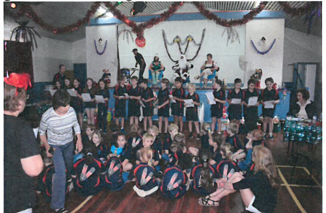
Above: The students from Dwellingup Primary School entertaining the Dwellingup seniors in the community hall.

Last Tuesday all of our students entertained the Dwellingup seniors. After the performances there was some very lively and enjoyable inter-generational dancing.