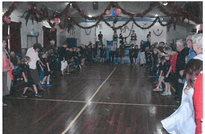
Above: The "Hokey Pokey" was lots of fun!