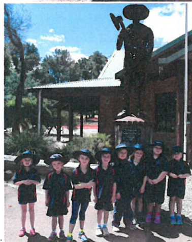
Left: There is an axeman out the front because Dwellingup started off as a timber town.