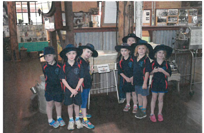
Above: The PP students in front of a basinet that was in the Dwellingup hospital that was burned down in the 1961 fire.

The pre-primary students are learning about the past. Students learned that a museum is a place that holds collections of objects that can tell us about the past. The students visited the Visitor Information Centre last week and looked at some interesting objects from the past.