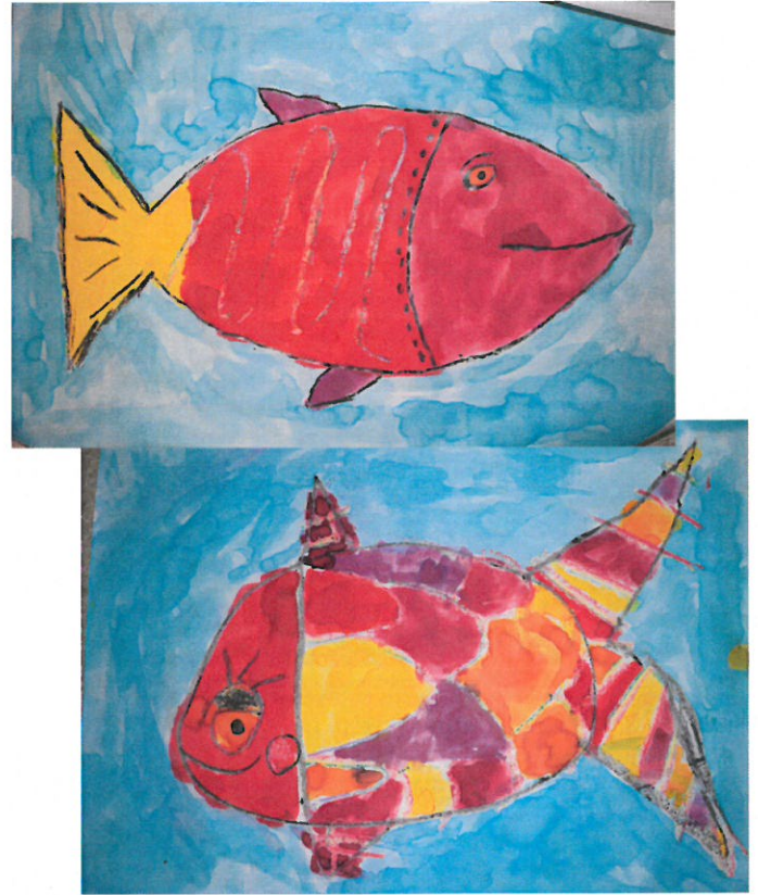
Beautiful fish Top: August-Rose Bottom: Emma-Lee