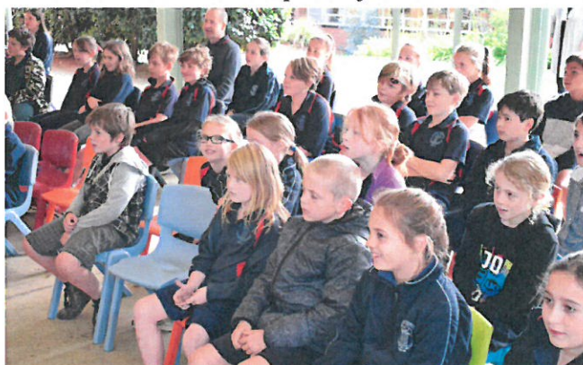
Above: An appreciative audience.