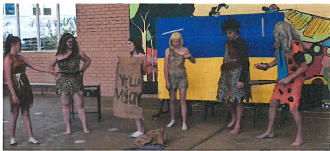
"The Caveman Comedian."