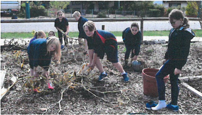
Above: Pulling out old pumpkin vines.

Our summer vegetable crop has been harvested so it's now time to plant up for winter. This week students pulled out the summer crop plants in preparation for our winter crop. Lots of muscle power was required! The old plants were 'recycled' in the compost heap.