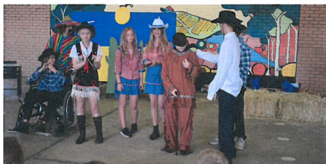
"The Cowpokes of Calico"