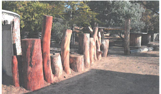
Above: The “Jurassic Wall”.