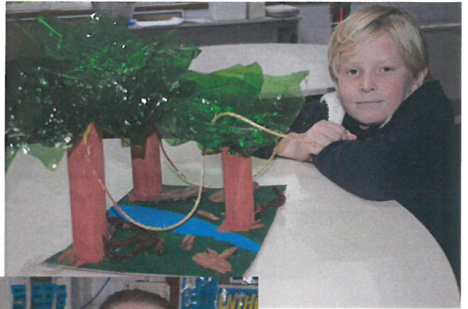
Above: Luca's Tropical Forest biome featuring a tree canopy and vines.

In Geography, year fives have been learning about the different biomes that constitute the Earth's surface. Biomes in Australia include Temperate Forests (Dwellingup), Tropical Forests, Oceans, Grasslands and Deserts. Students were required to research the features of one of these biomes and to then make a model. Next they have to establish a settlement on their biome and to learn about the issues associated with clearing.