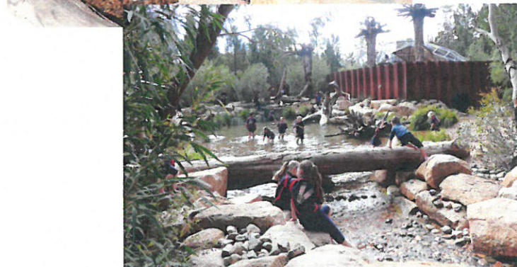
Above: There was some time at the end to relax and enjoy!