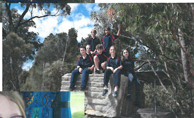
Below: The year 6 students pose on a rock in the "Naturescape" playground.