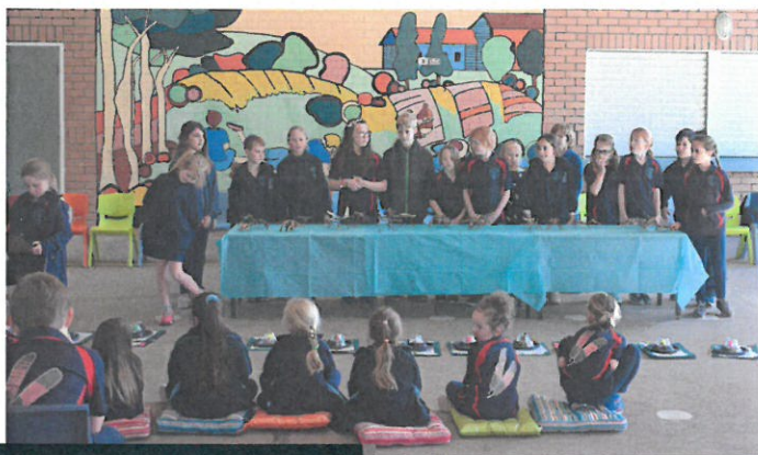
Above: Students display their insect sculptures.

Yesterday the students in years 2/3/4 presented us with an art show. They have been very busy and creative and have completed a variety of fabulous art pieces. In addition, they completed Procedure writing based on some of their work.