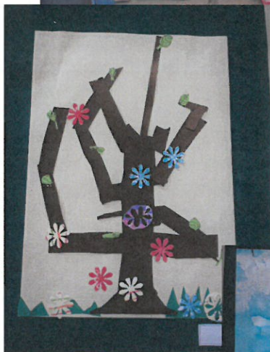
Left: 'Tree Collage' by Brax