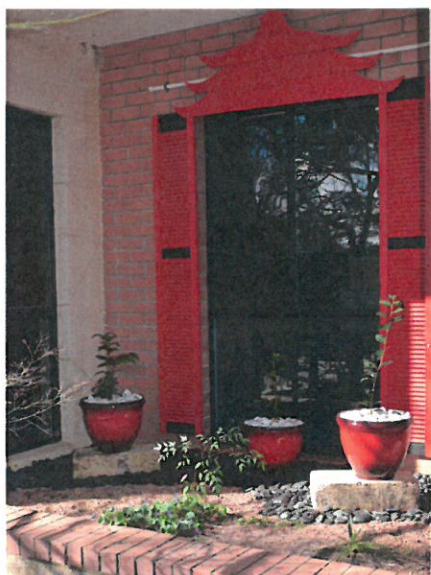
Left: Our Japanese themed garden feature.