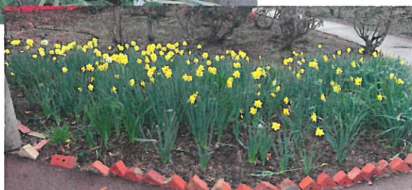
Above: Daffodils in the Mick French Community Garden

Our school garden is looking very colourful with a range of blossom and flowers blooming. Several years ago Mr Warren organised students in our school to dig up some daffodil bulbs from our school and to transplant them in the community garden. The reason for this? The bulbs had come from the community garden in the first place. Hopefully the past students who planted these have seen the results of their efforts!