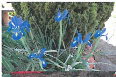
Left: Irises in our school garden.