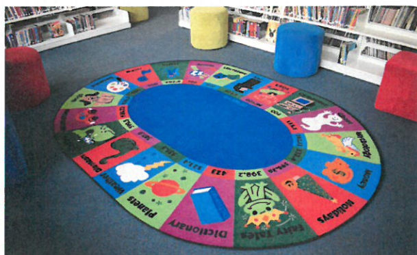
Above: A mat featuring the Dewey decimal classification system completed the Library transformation.

Apart from the books, our Library is practically unrecognisable.