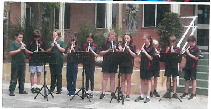
Above: The recorder players play "Amazing Grace".