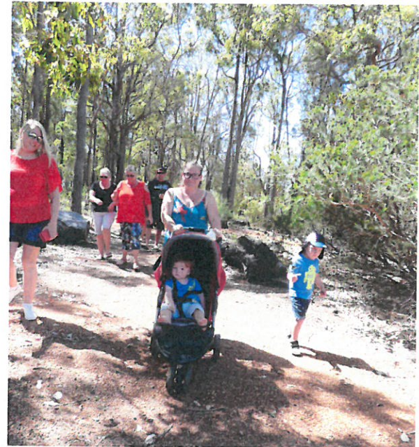
Above: A very important part of Orientation Day at Dwellingup Primary School is a walk around our beautiful school grounds and bushland.