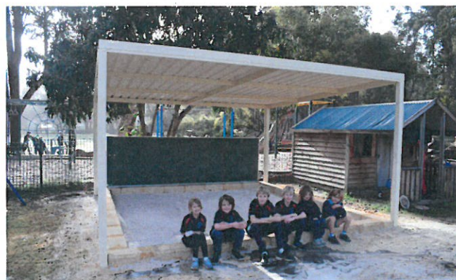
Above: Our new sandpit and shelter in the Playgroup area.

The poles in the small undercover area have been replaced.