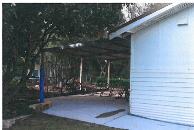
Above: Our new bike shed.