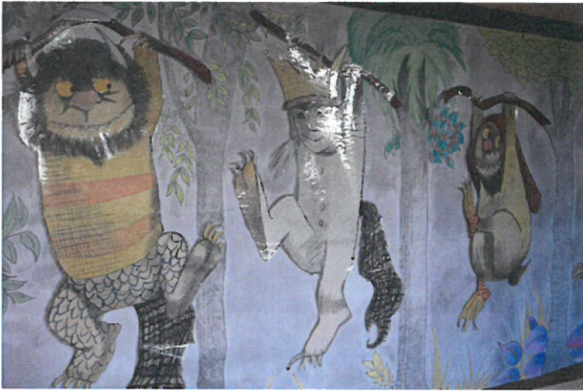
Above: The fabulous mural outside the years 1/2/3 room.