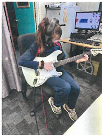
Below: Our students join students from other primary schools in some music making.