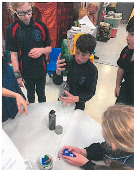
Left: Cowen is taking extreme care.

(Air pressure increases when heated –all relative to air pressure outside balloon)