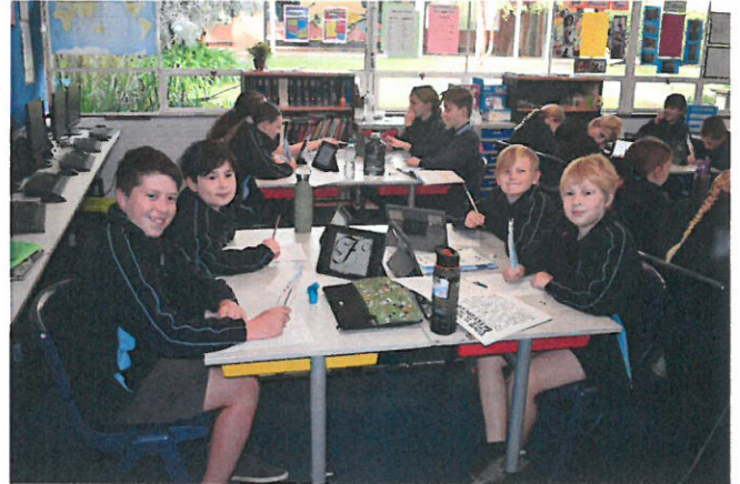
Above: Students authenticated their Shakespeare activity by using quill pens that they made.

Students have been studying aspects of Shakespeare as part of the “ Talk for Writing ” program. First of all they discovered that a lot of present day sayings were first recorded by William Shakespeare. These include: