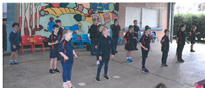
Above: The year 1/2/3 students and their wonderfully co-ordinated dance moves.