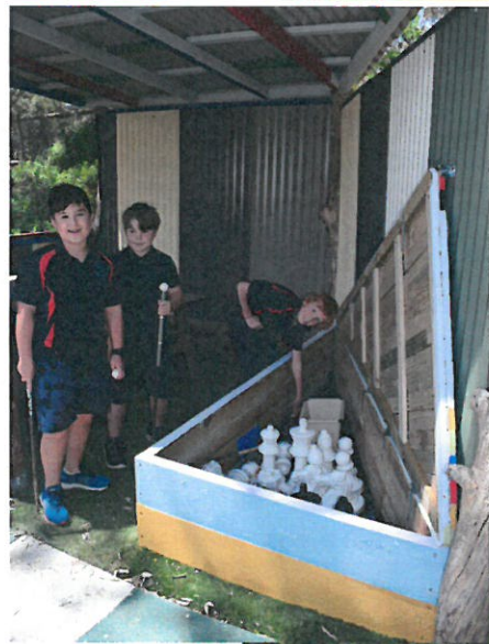
Above: A triangular seat / table complete with chequers table ... is also a storage place for giant chess pieces and mini golf equipment (left).