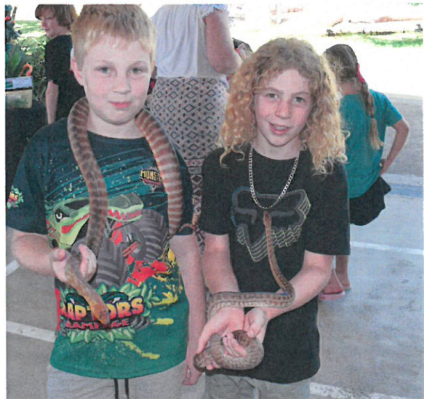
The reptile exhibition was very popular.