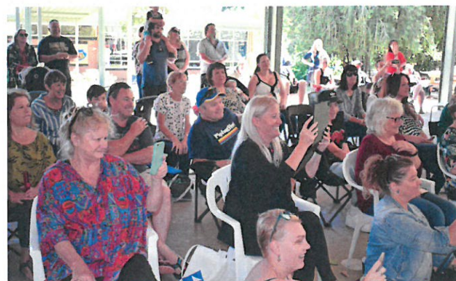
Below: The audience enjoying the entertainment!