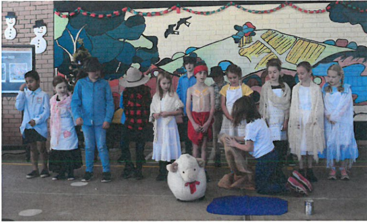
Above: "Waltzing Matilda" ~ years 1/2/3