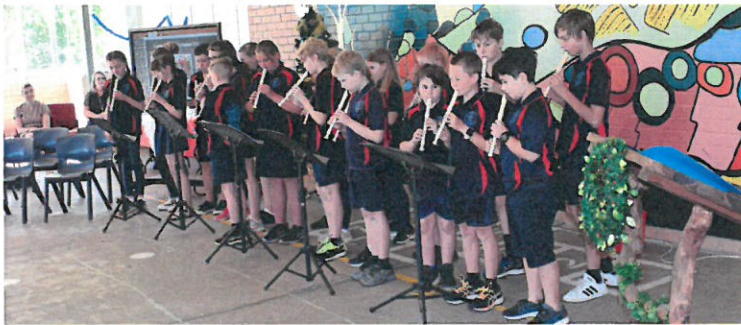
Above: The years 4/5/6 class played "Any Dream Will Do" on the recorder.