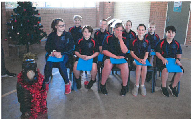
Above: The current year 5 students did a sensational job of running the Presentation / Graduation event.