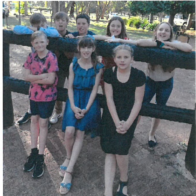
Above: The year 6 students enjoyed a social get together at the Redcliff Barn.