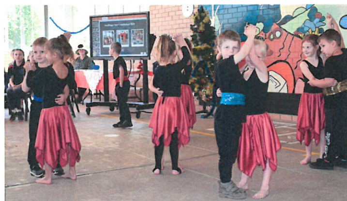
Above: "Waltz with a Twist"