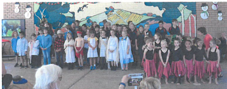
Above: The whole school concluded the ceremony with "I Am Australian"