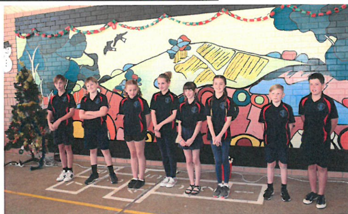
Above: "Standing Tall and Proud" ~ the graduating year 6 students.

Thank you to the above organisations for donating these awards. We also thank them for the good they do in our communities.