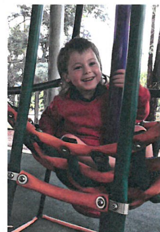
Below: We love our school in the bush! The K/PP class.