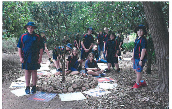
Above: Check out the slab path under the lemon tree.