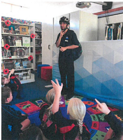
Left: It's very important to wear a bike helmet.

Students learned that at their age, they need adult support when they are out and about in the community.