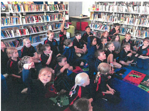
Below: The PP-3 students found the performance very entertaining.

Students in years 4/5/6 enjoyed and learned a lot from a performance called “Trending” . The performance covered the following concepts: