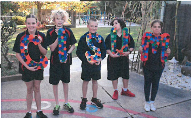
Above: What????? Below: What a relief! These students can spell after all!