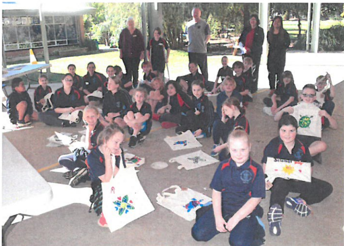
Above: Group photo with fabulous Batik bags.