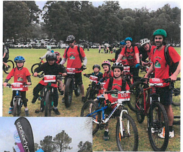
Above: Before the race.

year will allow the participation of the east coast elites which gives the event that true Australian championship feel.