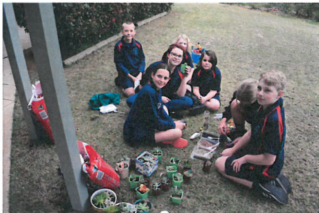
Above: Potting succulents.