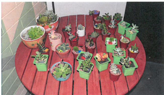
Above: The potted succulents.