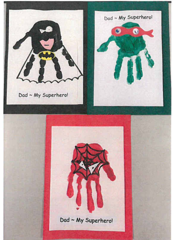
Above: The year 4/5/6 students decided that you don't need any other superhero but your dad.