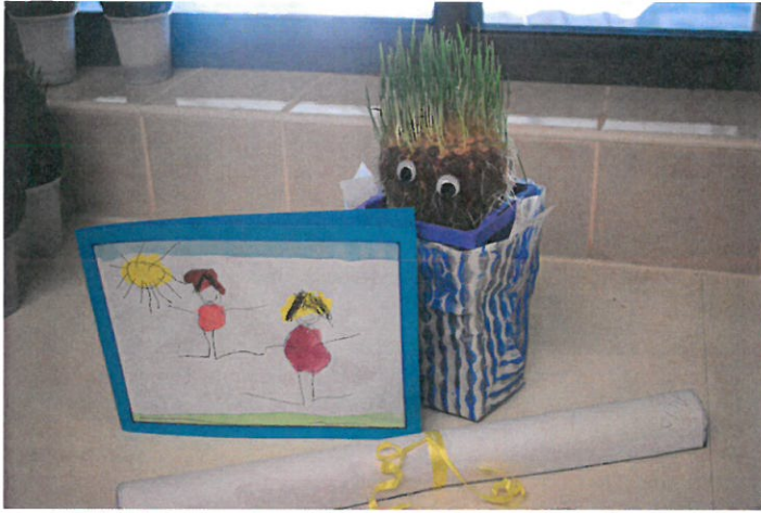
Above: K/PP students made hairy "seed heads", a lovely card and a special message.

Students took great pleasure in making gifts for their dads.