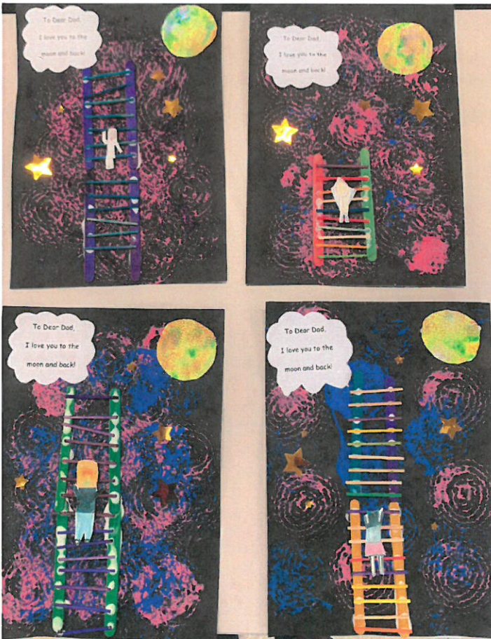
Above: Students in years 1/2/3 message to their dads was, "I love you to the moon and back".