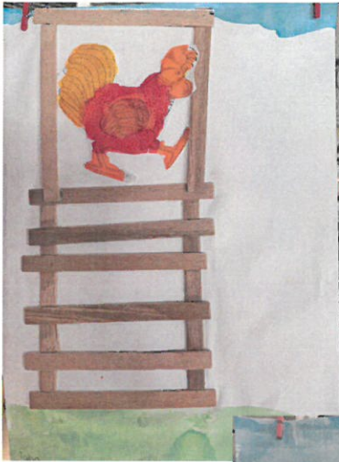
Rosie safely back in her hen house!

Students in years K/PP have been learning about Farms this term. They enjoyed the story about Rosie the hen who unwittingly outsmarted a fox!