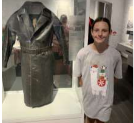
Left: Karly told us that the lighthouse keeper needed to wear this heavy jacket to keep him warm in wintry storms.

Below: We were delighted with the high level of interest that our students demonstrated in the Wadjemup Museum. The volunteers in the museum commented about the high level of interest and excellent behaviour of our students. Each student was required to provide a fact about something of interest to them in the museum. The facts were very impressive!