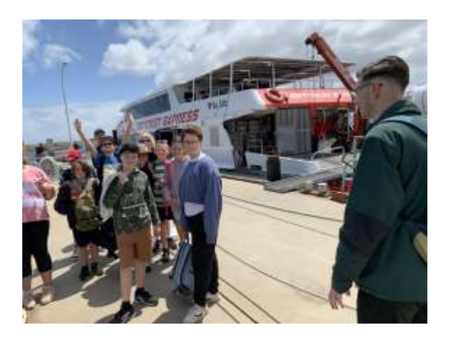
Above: All aboard the Rottnest Express.