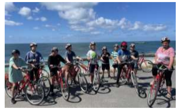
Above: All ready to set off to the Oliver Hill guns and tunnels.