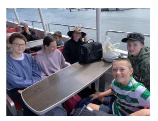
Above: About to depart...the water was extremely rough during the crossing.