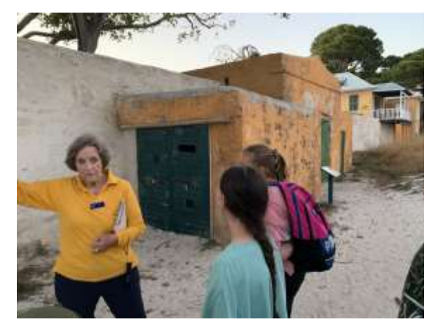
Above: The building with the green door behind the guide is a prison. We learned about the sad history of Aboriginal incarceration on the island.

Below: Men used to guide sailing ships through a channel into Fremantle Harbour in this pilot boat. We tried lifting the oars and they were unbelievably heavy! These men needed to row 23 hours straight and got punished if they swore or got drunk!