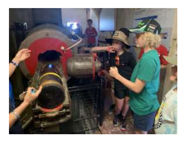
Above: Firing the guns was a team effort. Women completed the complicated calculations necessary.

Right: Tunnels were dug under the sand dunes to service the guns. We visited the engine room and the ammunition store.