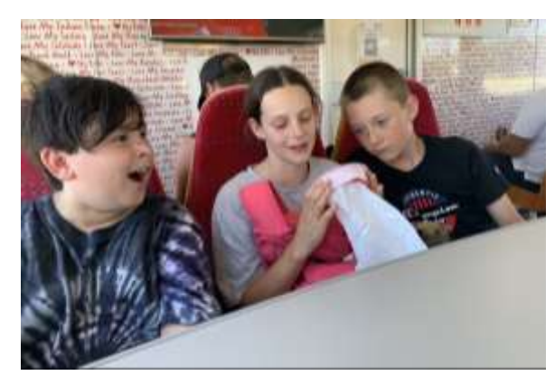
Above: The trip back on the ferry was much smoother!