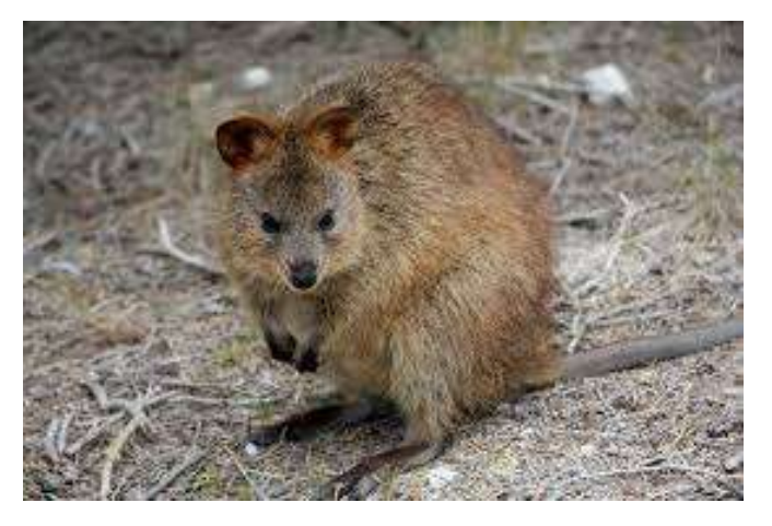
Above: Our first quokka sighting. Eve and friends named over 70 quokkas.