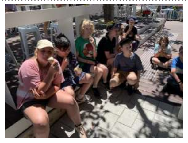
Above: We all enjoyed a Simmo's ice-cream before going off to shop for souvenirs for our families.