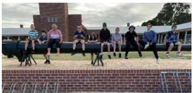
Above: This large gun outside Kingstown Barracks provided more than enough seating for our ten students.

Below: The quality of the meals was AMAZING !!