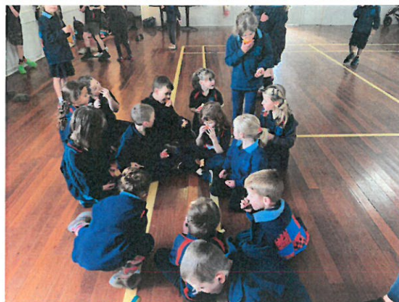
Above: Enjoying a snack before we start.