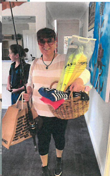
Right: A fishing rod & flippers!