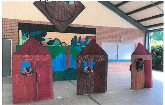
Below: Three pigs at home.

When I arrived back from my holidays I heard all about the year 4/5/6 " Revolting Rhymes " assembly that I missed. The year 4/5/6 class participated in a Drama workshop held by Pinjarra Senior High School and it was decided to hold a re-run of both assembly items.