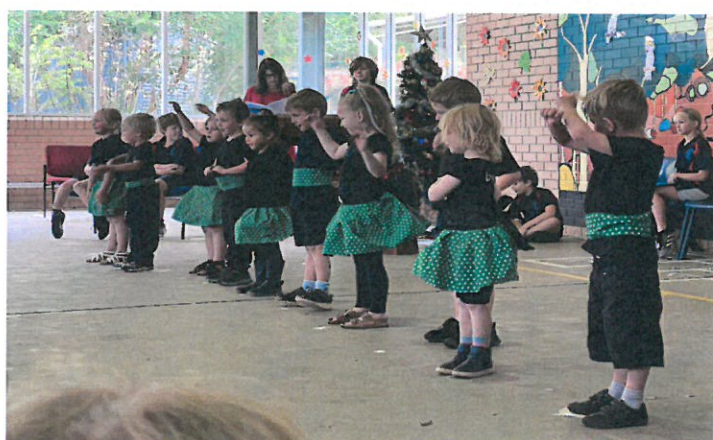
Above: Years K/PP Item: "Deck the Halls"