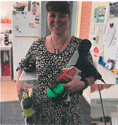
Left: A chainsaw, drill, jigsaw and appropriate PPE of course. Please be assured that these items were NOT used by the students!!!