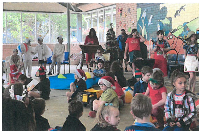
Above: Years 4/5/6 Item: "Aussie Jingle Bells".