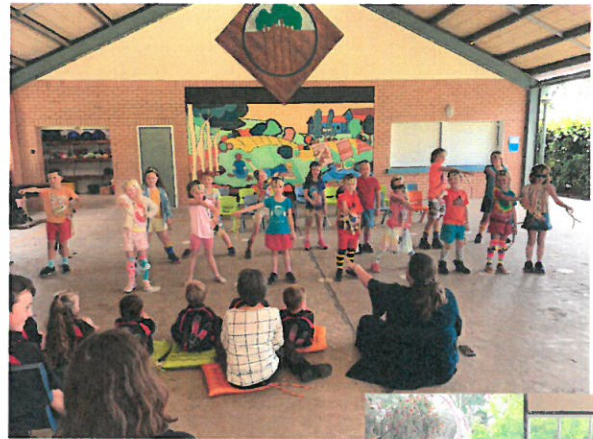
Above: A very lively version of YMCA.