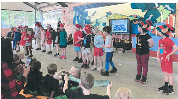
Below: Years 1/2/3 Item: "It's Christmas Time."