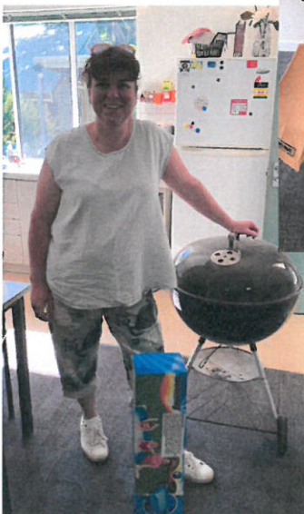
Left: A BBQ and a wading pool. What next?