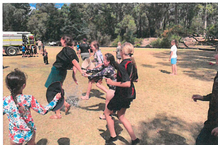
Below: Got her! Direct hit!