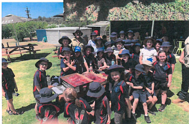
Above: The students are very proud of their berry picking efforts.