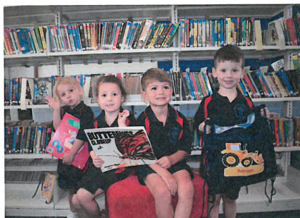
Above: Exploring the school. A visit to the Library.