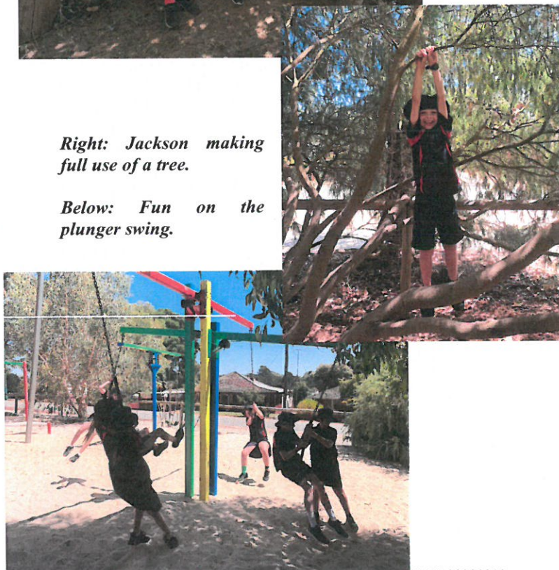
Below: Fun on the plunger swing.