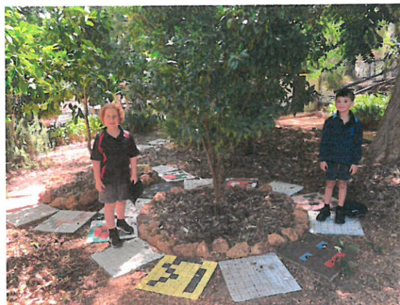
Left: Oliver & Otis made up a game called "Ground lava".

We are delighted that our students make the most of their amazing school grounds. A vast range of activities are engaged in and there seems to be different games happening every day. I was on duty at recess last week and these are just a few examples of what was happening: