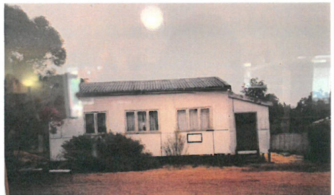
Above: The Baptist Church that was formerly at Banksiadale was moved to the site where "Touch of Aroma" is today in 1964.