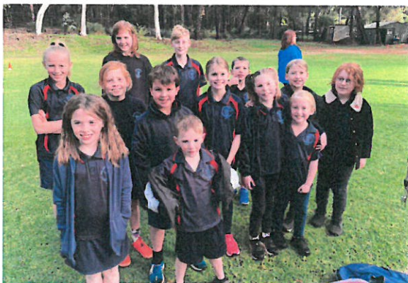
Above: "Team Dwellingup"