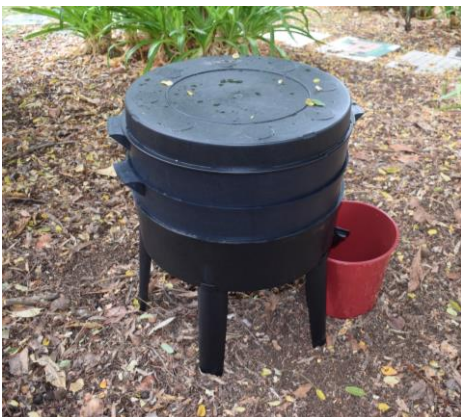
Left: Our new worm farm. Worm farms need to be placed in the shade.