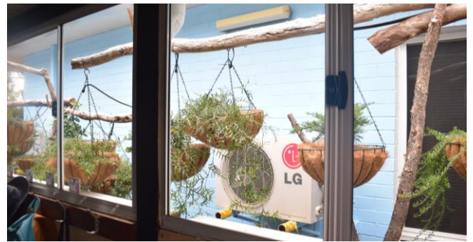
Above: We can’t wait to see red tailed black cockatoos on the blue wall.

Every fortnight students in years 4/5/6 ‘sort’ the containers that are collected around town as part of the “Containers for Change” program. Our main aim is to enable containers that would otherwise end up in landfill being recycled. A tremendous bonus is the money that is earned for our school. Funds earned are to be used to complete a mural in the passageway. Robyn Brown painted the existing mural (pictured below) which will be extended. In addition, we will have a flock of red-tailed black cockatoos ‘flying’ across the ‘sky’ behind the hanging baskets.