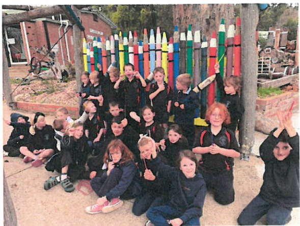
Above: "We love pencils ...and the amazing pencil installation at the entrance of the school."

We all enjoy our holidays, but it is always a pleasure to come back to a lovely fresh and clean school and to see the latest garden project.