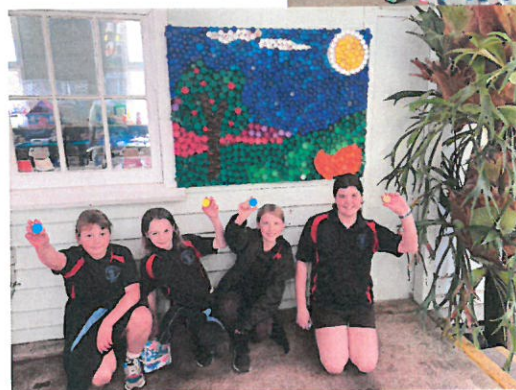
Above: The year 4/5/6 students kept these lids out of landfill by using them in an art project.