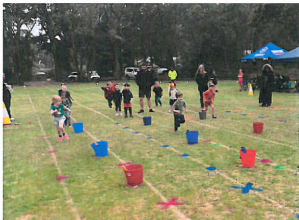
Above: The very exciting K/PP flag race.