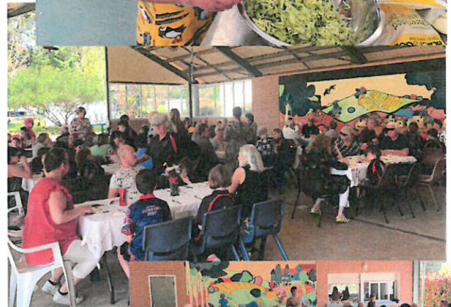
Above and left: The happy scene in our school undercover area.