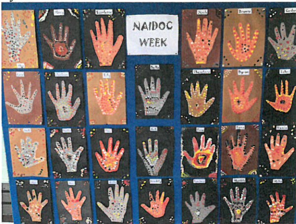
Above: Students in years PP-3 completed dot painted hands.