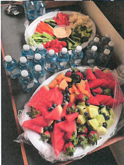
Left: Not only did the Craft Ladies teach our students new skills; they also provided this delicious and very healthy morning tea!