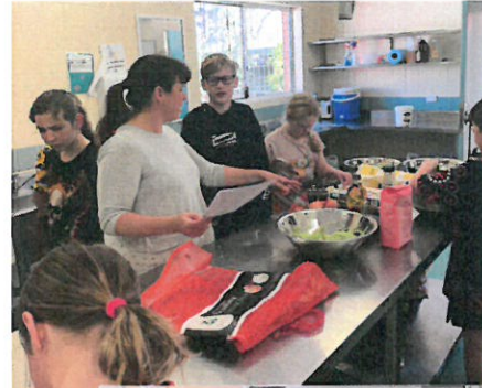
Left: Our school canteen was a busy and productive place on Thursday 7 th Sept.

The acknowledgement of the importance of elders continued with a lunch at school on the last day of term. Students issued invitations to a "Significant Elder" which enabled them to be with them and celebrate all that they bring to their lives. It was a lovely event that was enjoyed by all. The years 4/5/6 students prepared and cooked the delicious and healthy tomato soup and quiche.