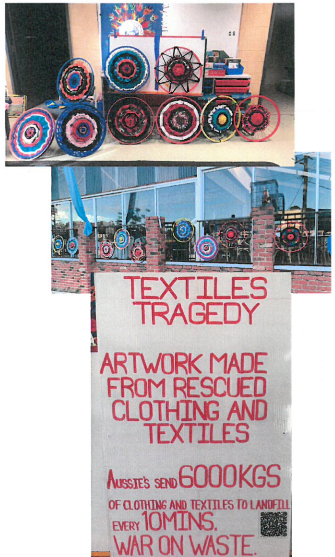
Below: Some of the stunning completed wheels.