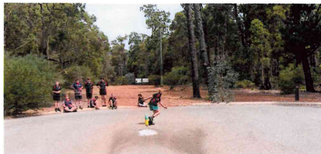
Above: The item had a spectacular grand finale with Alby B launching the rocket in the car park.

blowing out the cork and creating the power which propels the rocket.