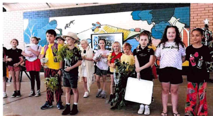
Above and below: Years 1/2/3 performed "Deck the Shed".