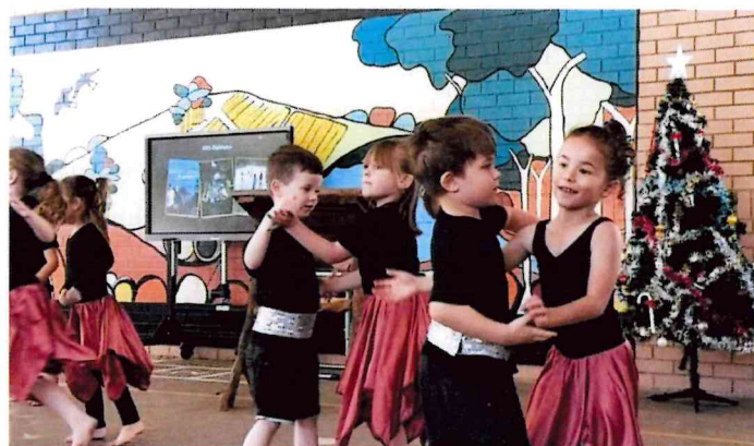
Above and below: "Waltz with a Twist"

A big thank you goes to the students for presenting such amazing entertainment and to the staff for all of the work that they put in before, on and after the day.