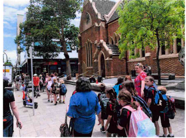
Above: We walked from the train station to His Majesty’s Theatre.

“It's not the destination, it's the journey” is a quote famously attributed to Ralph Waldo Emerson the American philosopher. I believe that the trip to His Majesty’s Theatre to see the W.A. ballet’s performance of “The Nutcracker” ‘ticked all boxes’. The standout feature of the day was the incredible behaviour of our students. All of the staff present were incredibly proud! We sincerely thank the Dwellingup Community Association for their grant of $800 which funded performance entry.