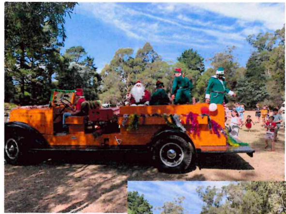
Above: Hooray ~ Santa has arrived.

Right: Ho ho ho ~ jolly Santa has arrived ~ in thongs!