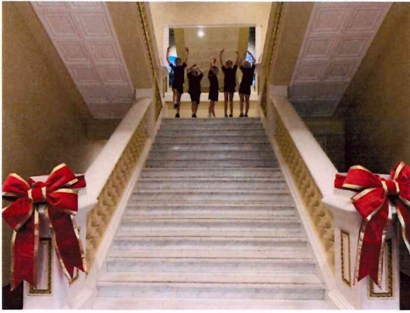
Above: Some ballerinas on the top of the stairs!