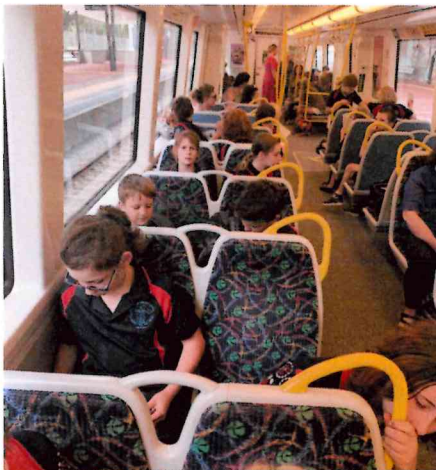
Left: On the train to Perth.

Below: You must be careful riding up the escalator.