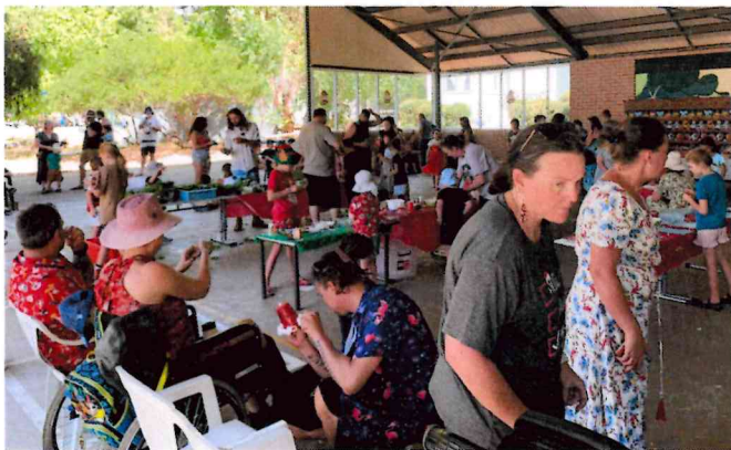
Above: An undercover area full of happy families ~ a wonderful event that brings the community together.