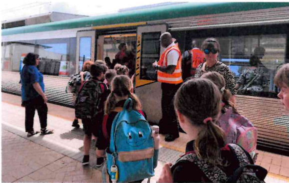
Above: The staff from Transperth supported us getting on and off the trains.