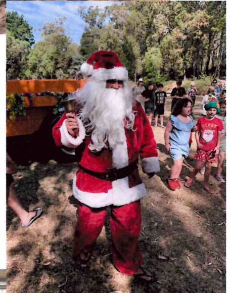
Below: Waiting for Santa!

Right: Ho ho ho ~ jolly Santa has arrived ~ in thongs!