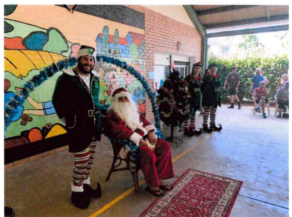
Above: Present time ~ Santa and the cheeky elves!